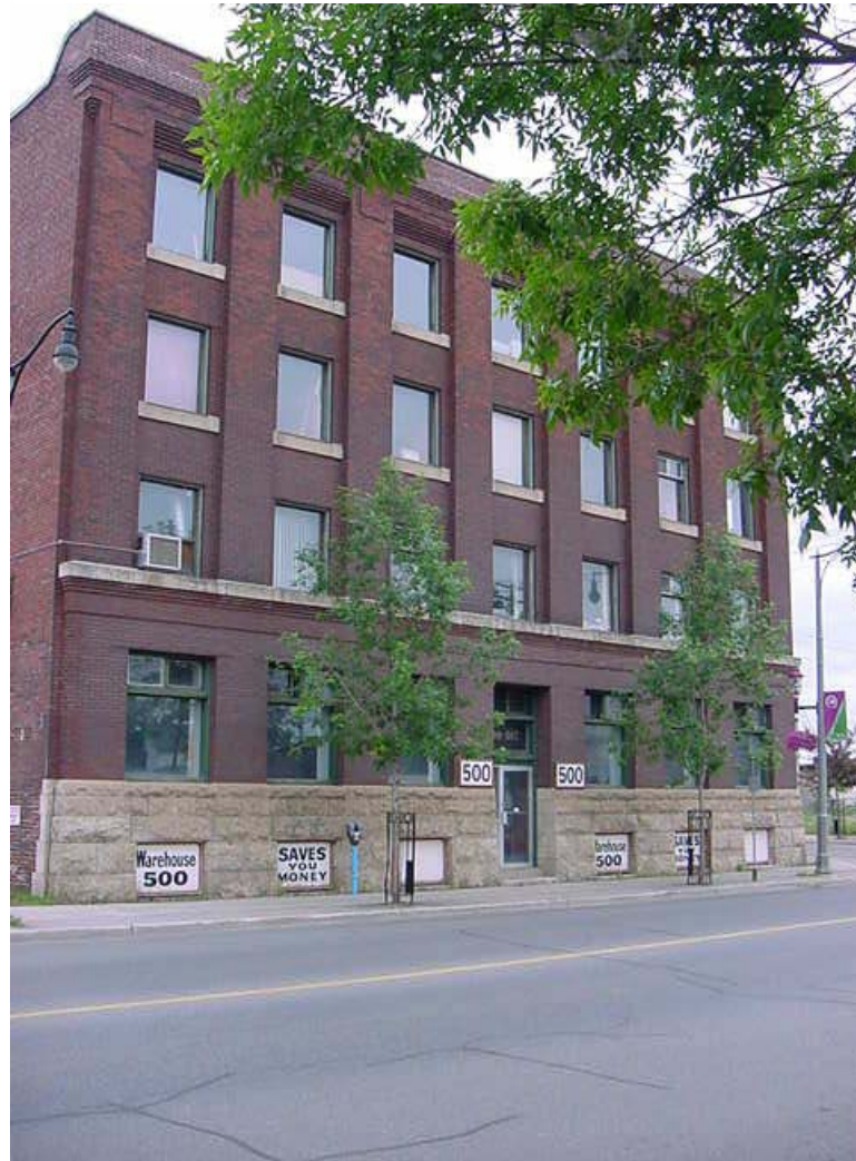
ANC OFFICE 500 SIMPSON STREET THUNDER BAY, ONTARIO