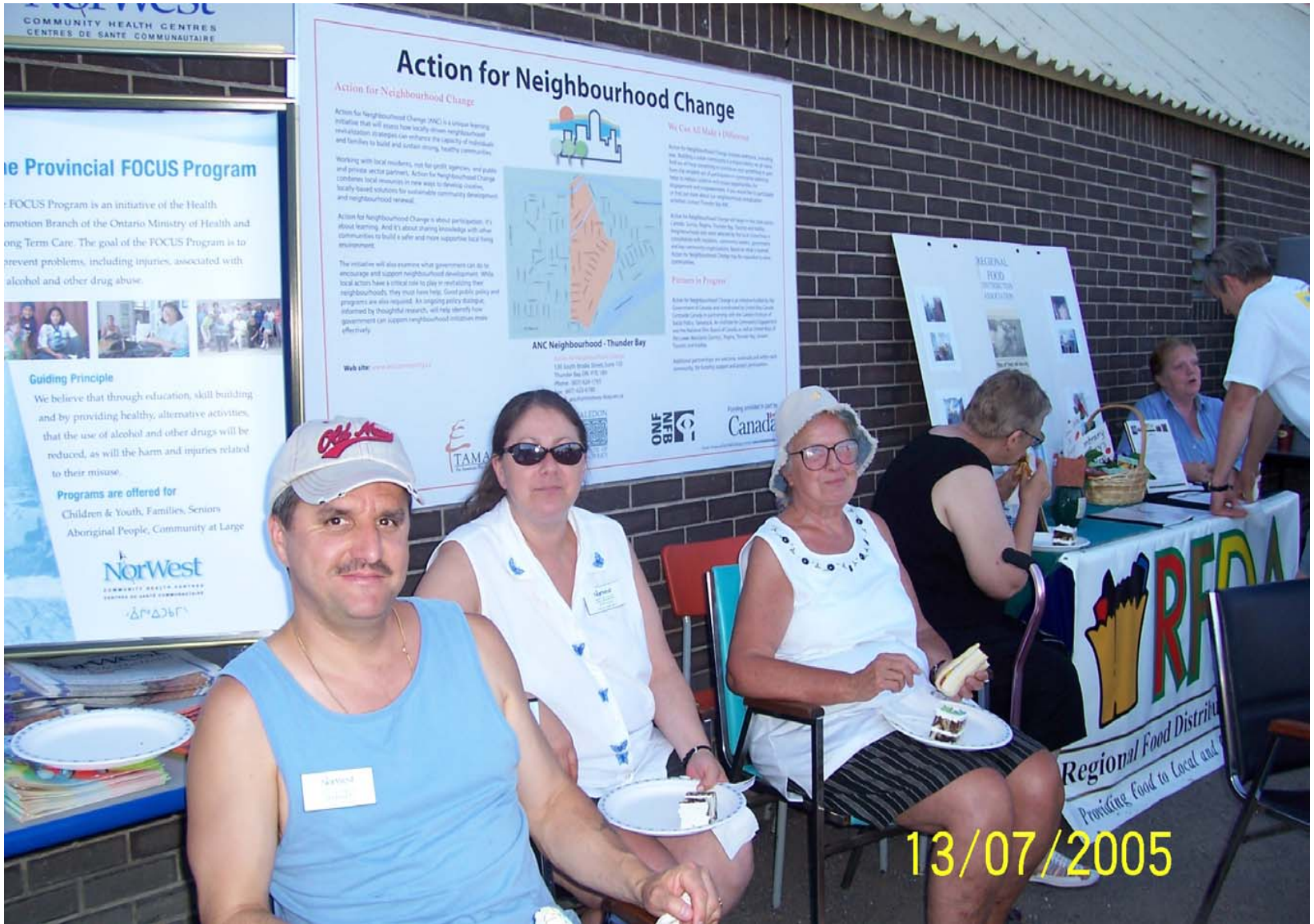
Information Booths at the GIANT BLOCK PARTY