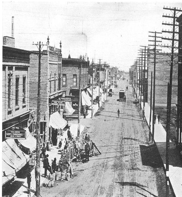
SIMPSON ST., FORT WILLIAM