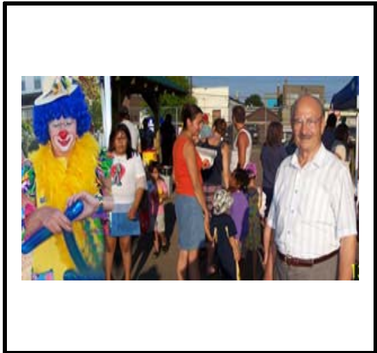
The Giant Block Party-Neighbourhood fun!